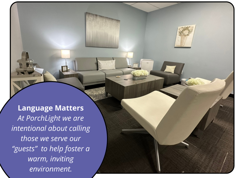
Ge due guest COME IN AND STAY AWHILE

Linda was able to move forward from the relationship with confidence, support and a positive pathway forward.